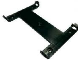
Wall Mount and Screws

If there are any items that are not included in the box please let us know so we can take care of that right away. Reach out to us at myaccount.cyberlynk.net .