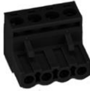
Terminal Blocks x 2