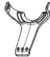
Handset Belt Clip