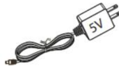
5V Power Adapter

If there are any items that are not included in the box please let us know so we can take care of that right away. Reach out to us at myaccount.cyberlynk.net and include the phone model plus the assigned extension of that phone.